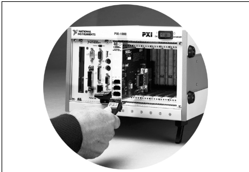
Figure 1. Seating the PXI-8252 Card